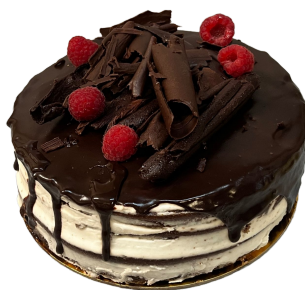
Chocolate Raspberry (VG)

Chocolate raspberry sponge with sweet cream cheese icing