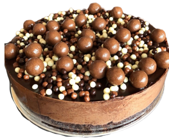
Malteser Choc Mousse

Chocolate sponge, coconut buttercream, raspberry jam