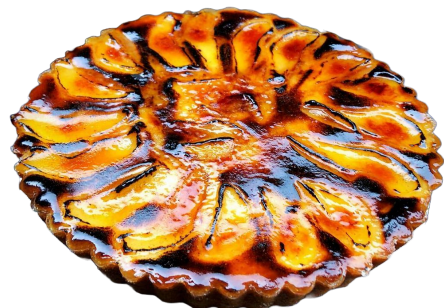
Pear & Ricotta Tart

Fresh citrus flavour and a sweet, creamy meringue topping