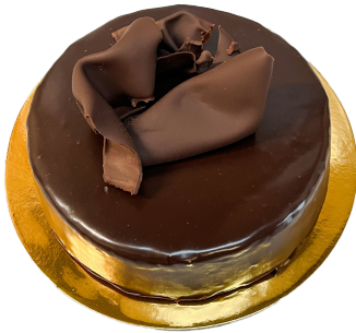
Chocolate Mud (GF)

Fudgy and decadent; topped with ganache and a shaved chocolate crown