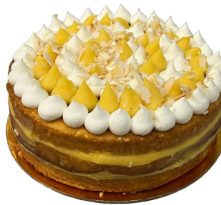
Lemon, Lime, Coconut

Fluffy madeira sponge cake with a sweet and tangy lemon curd filling, topped with scorched meringue