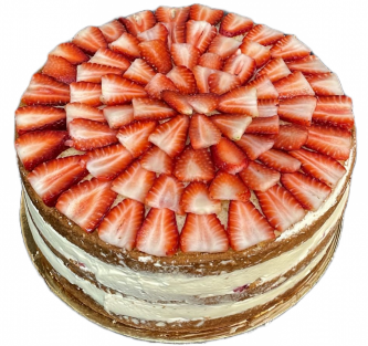
Strawberries and Cream

Coconut sponge, lemon curd & lime buttercream