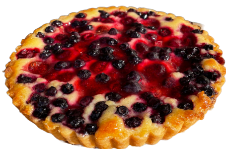
Mixed Berry Almondine

Ricotta cheese and pear tart with scorched sugar glaze