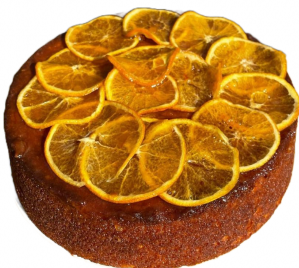
Orange & Almond (GF)

Fresh cream and berries on a layered sponge with chocolate